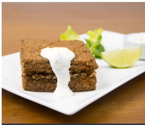
Kibbee with Yogurt