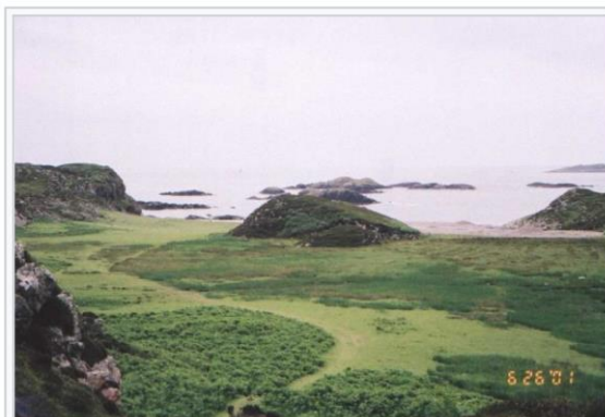
St. Columba's Bay, where the saint first landed on Iona

St. Columba's feast day is June 9, and with St. Patrick of Ireland (March 17) and St. Brigid of Kildaire (February 1) is one of the three patron saints of Ireland. The three are buried together in Downpatrick in County Down, deep within the famous Hill of Down.