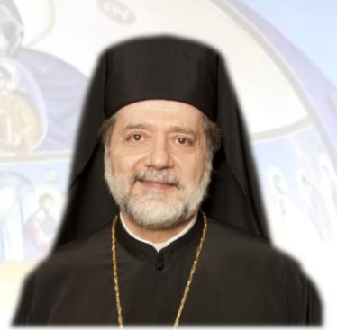
Presiding and Homilist:

All the Faithful Are Invited to Bring and Bear Icons Declare the Faith of the Apostles in Words and Images!