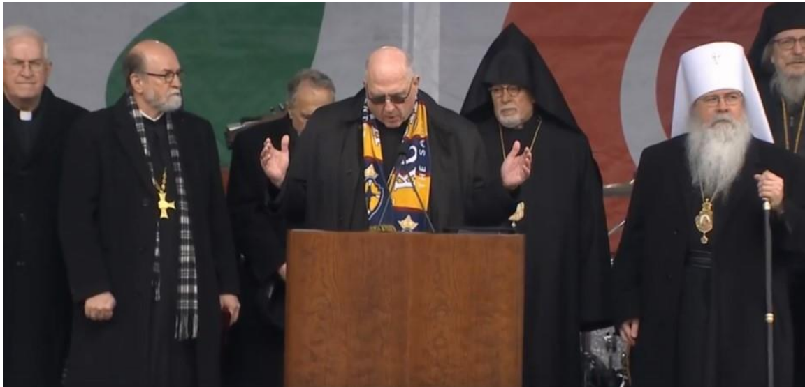
Orthodox and Roman Catholic bishops joined together in opening with prayer the March for Life in Washington last Friday. Memory Eternal to millions of innocents whose lives have been taken in the womb.