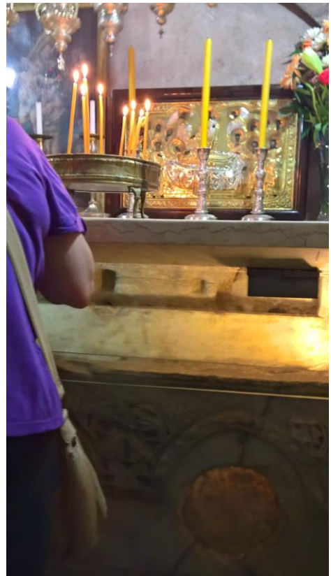
Inside the shrine of Mary's tomb, with the icon Panagia Ierosolymitissa affixed above it, is found the stone bench on which the Virgin's body was laid out, now encased in glass.