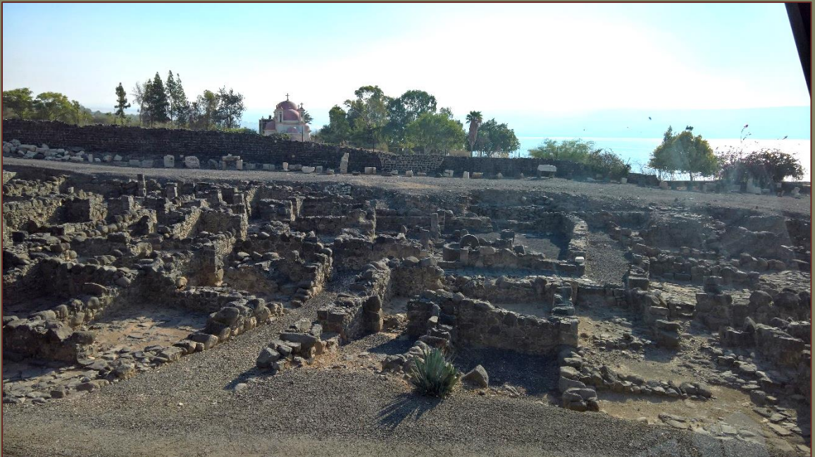
Excavations of 1 st -century homes in Capernaum, by the Sea of Galilee, where Jesus began His ministry.

HOLY FATHERS SLAIN AT SINAI AND RAITHU • VIRGIN-MARTYR AGNES VENERABLE THEODOULOS, SON OF NEILOS THE WISE OF SINAI NINA, EQUAL-TO-THE-APOSTLES AND ENLIGHTENER OF GEORGIA SABBAS, FIRST ARCHBISHOP OF SERBIA